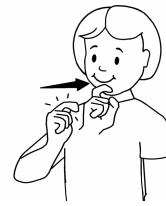
afternoon NT TAS SA VIC WA