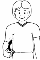
afternoon ACT NSW QLD